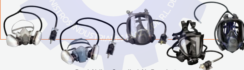
Dual Airline Supplied Air Respirator