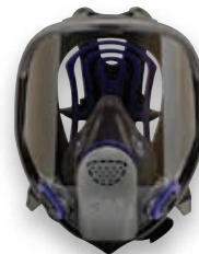
Ultimate FX FF-400