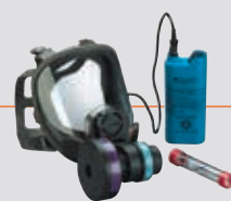
Face-mounted PAPR † (available for 6000 FF only)