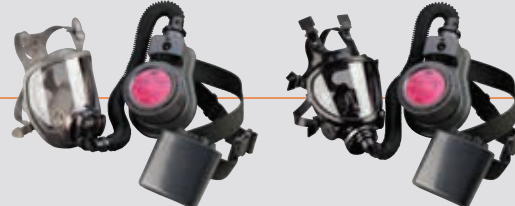
Belt-mounted PAPR †